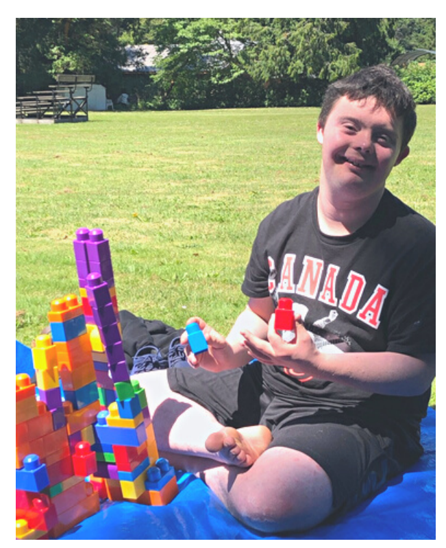
Image: A camper making a tower of blocks outside outside at summer day camp.